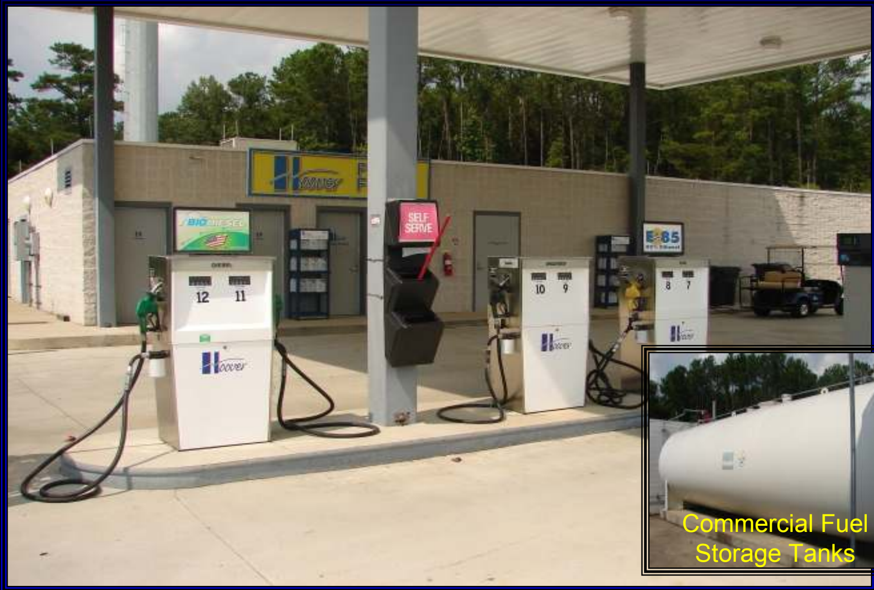
Commercial Fuel Storage Tanks