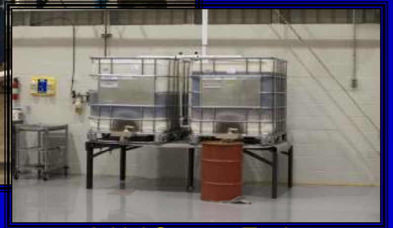
Initial Storage Tanks