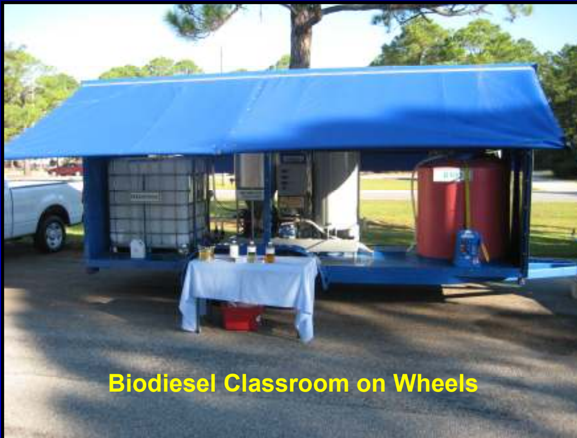
Biodiesel Classroom on Wheels